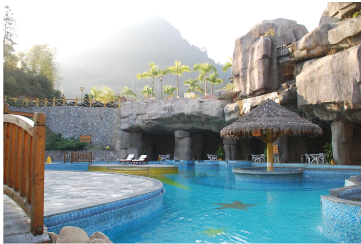
View of Guai'an Hot Spring